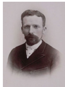
Vincent van Gogh, Age 18