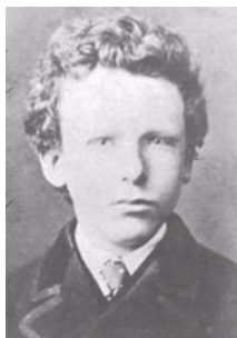
Vincent van Gogh, Age 13