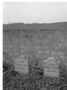
Graves of Vincent and Theo van Gogh Auvers