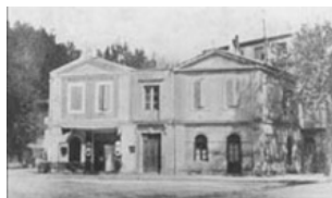
The Yellow House Arles