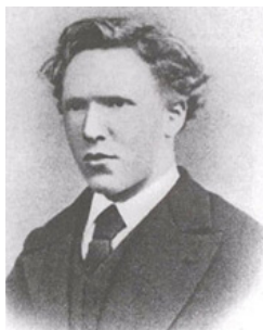
Theo van Gogh, 1890