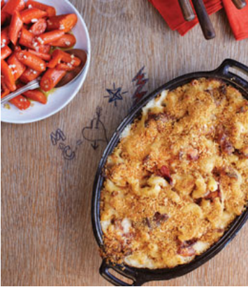
Download the recipes for Smoky Bacon Mac and Mac Sauce