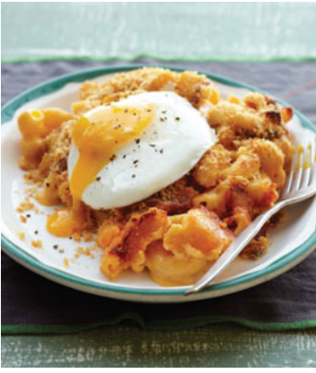
Download the recipes for Breakfast Mac and Mac Sauce