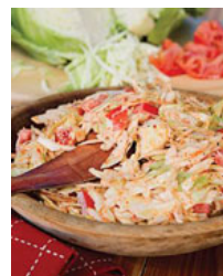
Mama's Slaw [PDF]