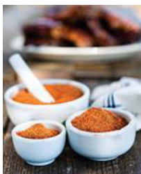
Basic Chicken Rub [PDF]