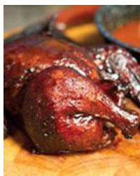
Whole Chicken [PDF]

Click on the photos below to download printable recipes from the book [PDF].