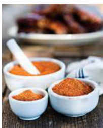
Basic Chicken Rub [PDF]