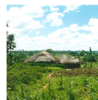
Typical northwest Ugandan houses