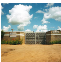
CARE's headquarters in Arua, Uganda