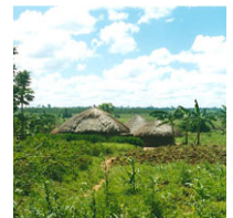
Typical northwest Ugandan houses