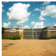
CARE's headquarters in Arua, Uganda